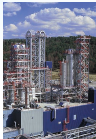
Polyolefin production in Stenungsund