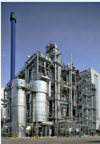
Melamine production in Piesteritz

Borealis operates in over 120 countries. The corporate head office is based in Vienna, Austria. The majority of Borealis' production is located in Europe, with two overseas manufacturing facilities in the United States and Brazil. Borouge, Borealis' joint venture with the Abu Dhabi National Oil Company (ADNOC), operates the largest petrochemical complex in the world.