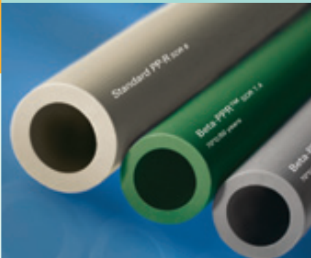
Comparison of standard light grey PP-R and new Beta-PPR pipes in green and steel grey