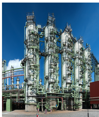
Olefin production in Porvoo, Finland

In re-inventing essentials for sustainable living, we build on our commitment to safety, our people, innovation and technology, and performance excellence. We are accelerating the transformation to a circular economy of polyolefins and expanding our geographical footprint to better serve our customers around the globe.