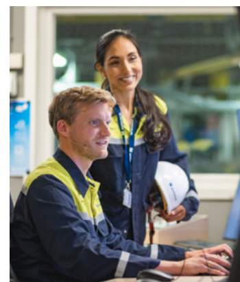
Borealis has 6,000 employees