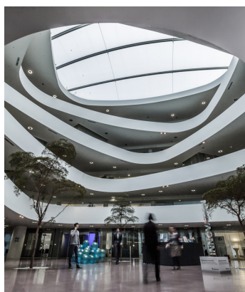
Innovation Headquarters in Linz, Austria