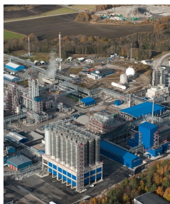
Polyolefin production in Stenungsund, Sweden