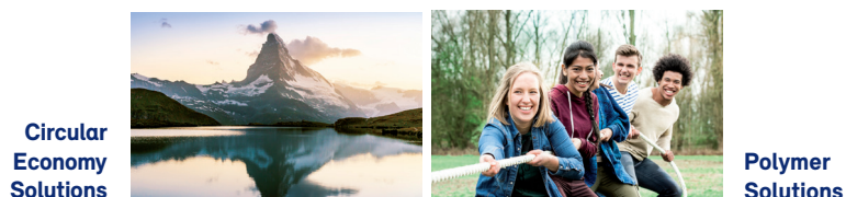
Fig. 2: Industries served by Borealis' polyolefins applications

With our advanced polyolefins for virgin and circular economy solutions, we serve these industries: