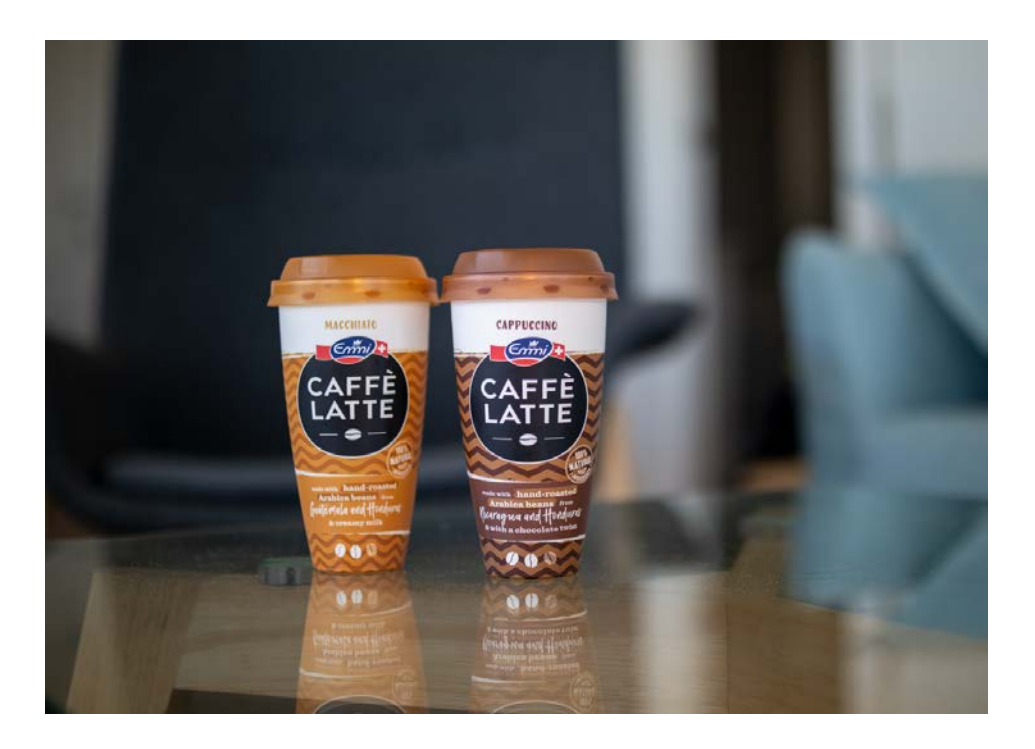
Photo: Focusing on recyclable packaging and the use of recycled materials, together with Borealis and Greiner Packaging, Emmi is taking their next big step with the Emmi CAFFÈ LATTE brand.