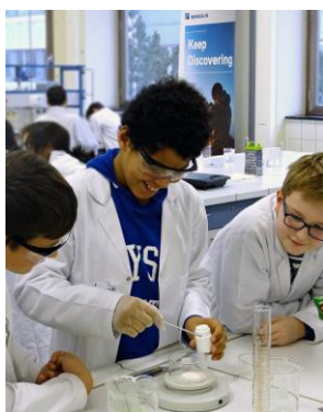
Photos: Young researchers at the interactive STaR laboratory at the TGM school in Vienna