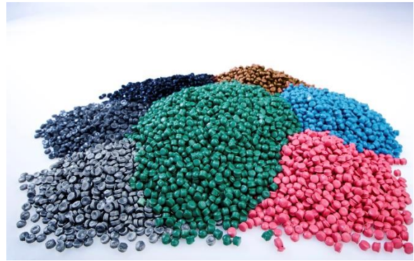
photo : Recyclates from mtm save approximately 30% of CO2 emissions compared to virgin materials.